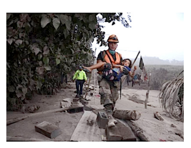
4. Un trabajador de los equipos de rescate de Guatemala ayuda a una niña en El Rodeo, Escuintla